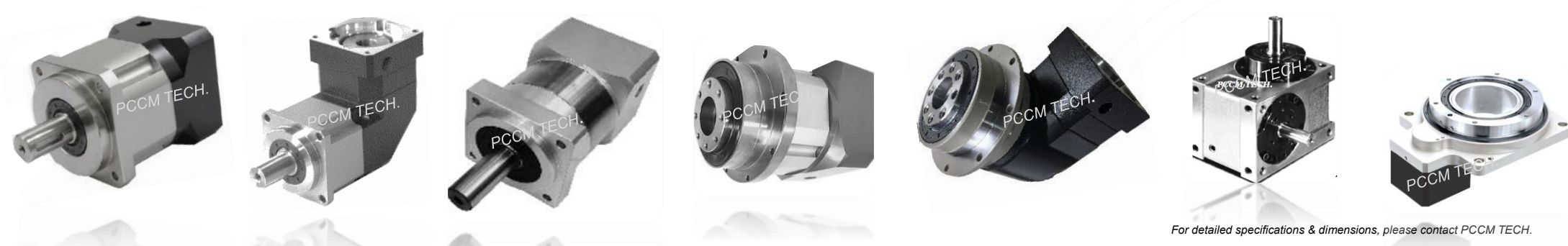
For detailed specifications & dimensions, please contact PCCM TECH.

APPLICATIONS: machine tool, packaging machines, food machines, plasma cutting machines, water-jet, bending machines, textile machines, printing machines, drilling machines, lathes and turning machines, milling machines, grinding machines, metal-forming machines, beverage processing machines, agricultural machines, shoemaking machines, wooden machining, laser cutting machines, inspection machines, welding machines, SPM, semi-conductor equipment, automation equipment, and so on.